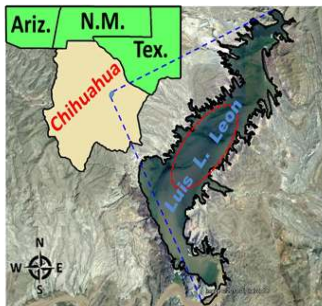
Figure 1. Luis L. Leon reservoir in Chihuahua State. The location of fish sampling (ellipse) within the reservoir is represented.

Many uranium deposits are reported in the State of Chihuahua [30], and as a result, an environmental radiological surveillance program has been established. Through various studies conducted in the Sacramento-Chuviscar River basin, high activity concentrations (AC) of radionuclides in surface water, groundwater, sediments and biota have been found [31–33]. Based on these studies, we have identified the need to know if uranium and other radioactive isotopes may reach the reservoir Luis L. Leon, after transport or leaching from Chihuahua Sacramento Valley to the Conchos River. To our best knowledge, radioactivity in water, sediments or fish has not been reported for this reservoir.