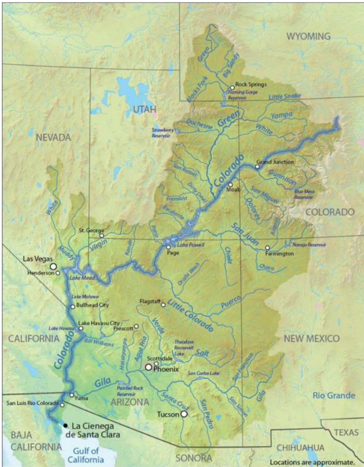
Fig. 4. Map of the Colorado River basin and delta. Note that the Gulf of California (shown here) is also known as the Sea of Cortez.

Notwithstanding those protestations, in the post-World War II period Mexico’s trade began relying increasingly on the U.S.—with interspersed periods of growth and retrenchment. In Mexico’s north, the maquiladora program that promoted development of foreign-owned assembly plants in the border region began in 1965, spurring a take-off