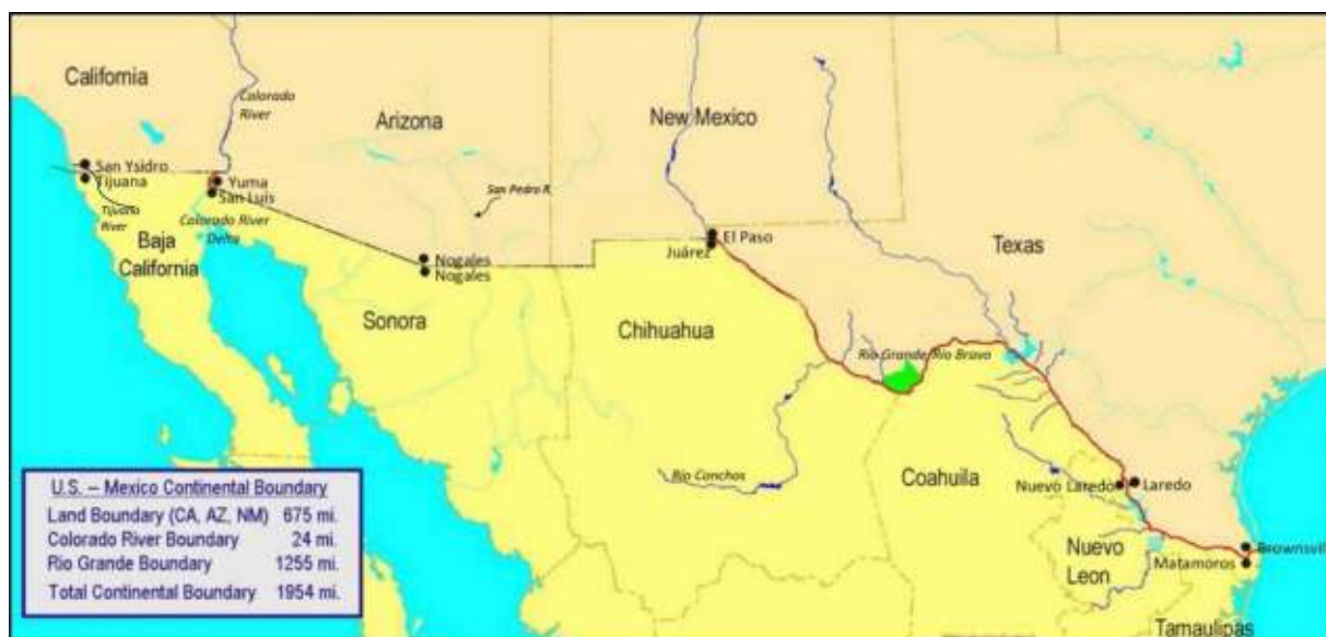
Fig. 2. U.S.-Mexico border, border states, and selected rivers. (Source: Adapted by the authors from IBWC, n.d.)

knowledge, exhibit strong leadership, and accept change and uncertainty (Folke et al., 2005). Actors can take advantage of disruptions (e.g., new policies, funding opportunities, or even natural disasters) to help shift toward adaptive governance (Olsson et al., 2006).